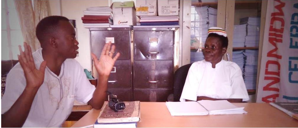
SIPD staff engaging a medical practitioner at a rural referral hospital

The baseline confirmed that indeed only 45% of women in Uganda for example, deliver at the hands of medical healthcare providers and close to 55% women deliver at the hands of the Traditional Birth Attendants (TBAs). Recently there was a plan by government to phase out TBAs and replace them with non-traditional health workers. TBAs don't have information concerning rights based care and management of babies born intersex but are closer to and more affordable for the people in the communities than medical facilities. The recommendation of SIPD to government is to train and equip them with enough information and tools rather than to ban them. This survey revealed that the Western medical approach to intersex is not dominant in East Africa, which is largely more rural than urban, and that the predominant approach is traditional riddance.